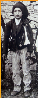
St. Francisco Marto 11 Jun 1908 - 4 Apr 1919

"I love God so much! But He is very sad because of so many sins! We must never commit any sins again". (St. Francisco)