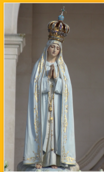
"I am The Lady of the Rosary" (13 Oct 1917)