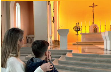
An Teaghlach Naofa (The Holy Family) www.anteaghlachnaofa.ie

"Continue always to pray the Rosary every day". (Our Lady, 13 Oct 1917)