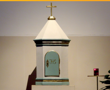
"The Hidden Jesus" - Fatima parish church

"We can take as our example, St. Francisco and St. Jacinta, whom the Virgin Mary introduced into the immense ocean of God's light and taught to adore Him. This was the source of their strength in overcoming opposition and suffering. God's presence became constant in their lives, as evident from their insistent prayers for sinners and their desire to remain ever near 'The Hidden Jesus' in the tabernacle". (Pope Francis 13 May 2017, Fatima)